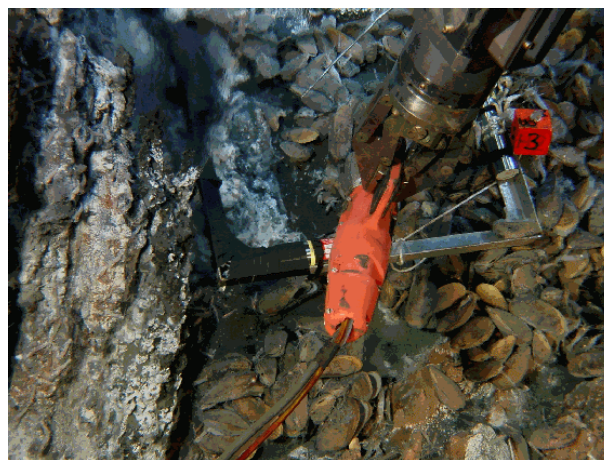
In situ analysis using ALCHIMIST in a clumps of Bathymodiolus azoricus . Menez Gwen, ATOS

Concurrently, in vivo experimentations at ambient pressure or in situ simulated conditions (using IPOCAMP flow through pressure chamber associated to the chemical regulation device SYRENE) represented an important part of the on board work. The bivalve Bathymodiolus azoricus , present on the 3 fields studied, was the preferred experimental model. Experiments have been conducted on a variety of biological endpoints including blood physiology, animal behaviour and growth, DNA damage, and heavy metal bioaccumulation and toxicity.