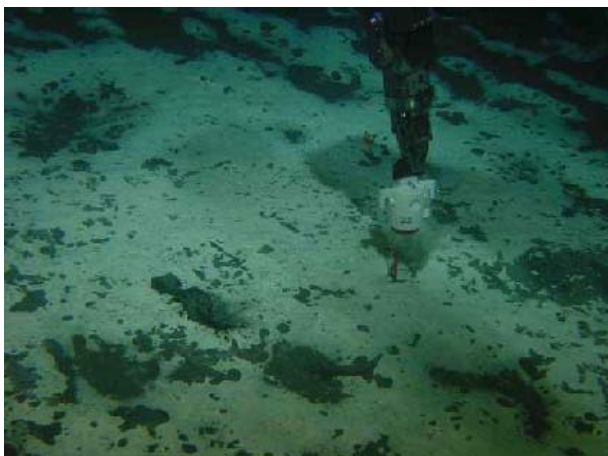
The sediment surface is covered with white mats of sulfide oxidizing bacteria (probably Beggiatoa ) sampled with a tube corer. HMMV, .AWI cruise, Ifremer©

Advanced techniques of the "VICTOR 6000" system like the mosaicking of digital video signals were used, for example, estimating deep sea demersal fish abundances along transects. Sediment samples were taken with the manipulator arms of the ROV at defined locations of the long-term station, e.g. areas with high degree of biogenic structures versus less structured areas. Samples for geochemical characterisation were also taken to investigate the geochemical milieu within the surface sediments. This information is valuable to understand faunal species composition, distribution and abundances in the deep sea environment. For this purpose an in situ microprofiler was deployed by means of "VICTOR". This microprofiler was newly designed to be (re)placed and activated by the ROV, after having been transported to the sea floor by the shuttle lander (ascenseur). The system consisting of a profiler unit (vertical resolution up to 0.1 mm) which can be equipped with up to 8 microsensors for O 2 , H 2 S, pH, and resistivity, a deep-sea power supply and syntactic foam blocks for weight compensation. By a special switch "VICTOR" can initiate a profile measurement. After the measurement has been finished, the profiler unit can be transferred to another place and re-activated by the ROV for further measurements.