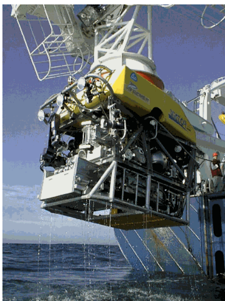
Victor 1° cruise

POSIDONIA positioning system (0.5% of water depth in standard acoustic environment), make it possible to obtain the sensor's trajectory measuring data suitable for map drawing. The production of on-profile optic images from successive shots is now possible. As part of a research project, a detailed bathymetric survey carried out using a multi-beam echosounder (Reson Seabat 8101/240 khz) have been tested on the vehicle and assessed during the Caracole cruise. Concerning handling and sampling operations, the MAESTRO slave/master arm has been improved with regard to both robotics and manoeuvring. A second grasping arm has been installed. A first prototype of the lifting shuttle in its simplest version has been tested and used to transfer equipment and samples from the seabed to the surface (and conversely) during a dive.