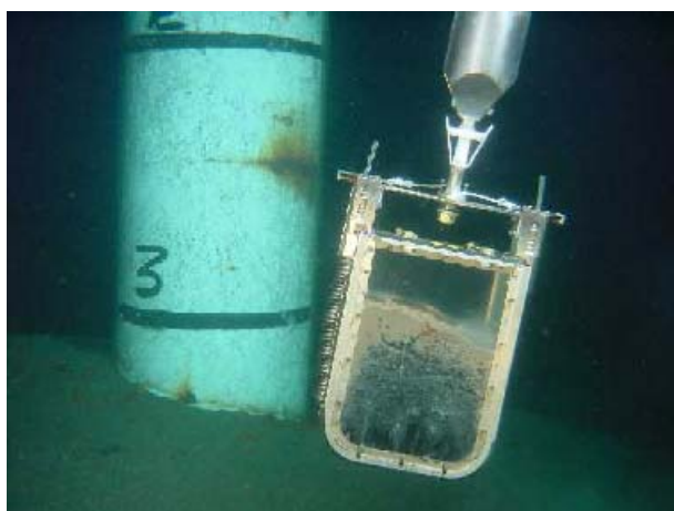
Sediment sampling for fauna analysis close to a well head. Biozaire cruise, Ifremer©

Several sites were selected for the Victor 6000 m dives from 400 m to 4000m depth allowing to 1) describe the structure (diversity and biomass) of the benthic communities near exploration well heads , 2) to understand the formation of topographic mounds which are in fact deep coral structures, 3) to observe the variation of biological activity influenced by the terrigenous input through the Zaire canyon, and 4) to study the original communities living on pockmarks in relation with the chemical and physical substrates.